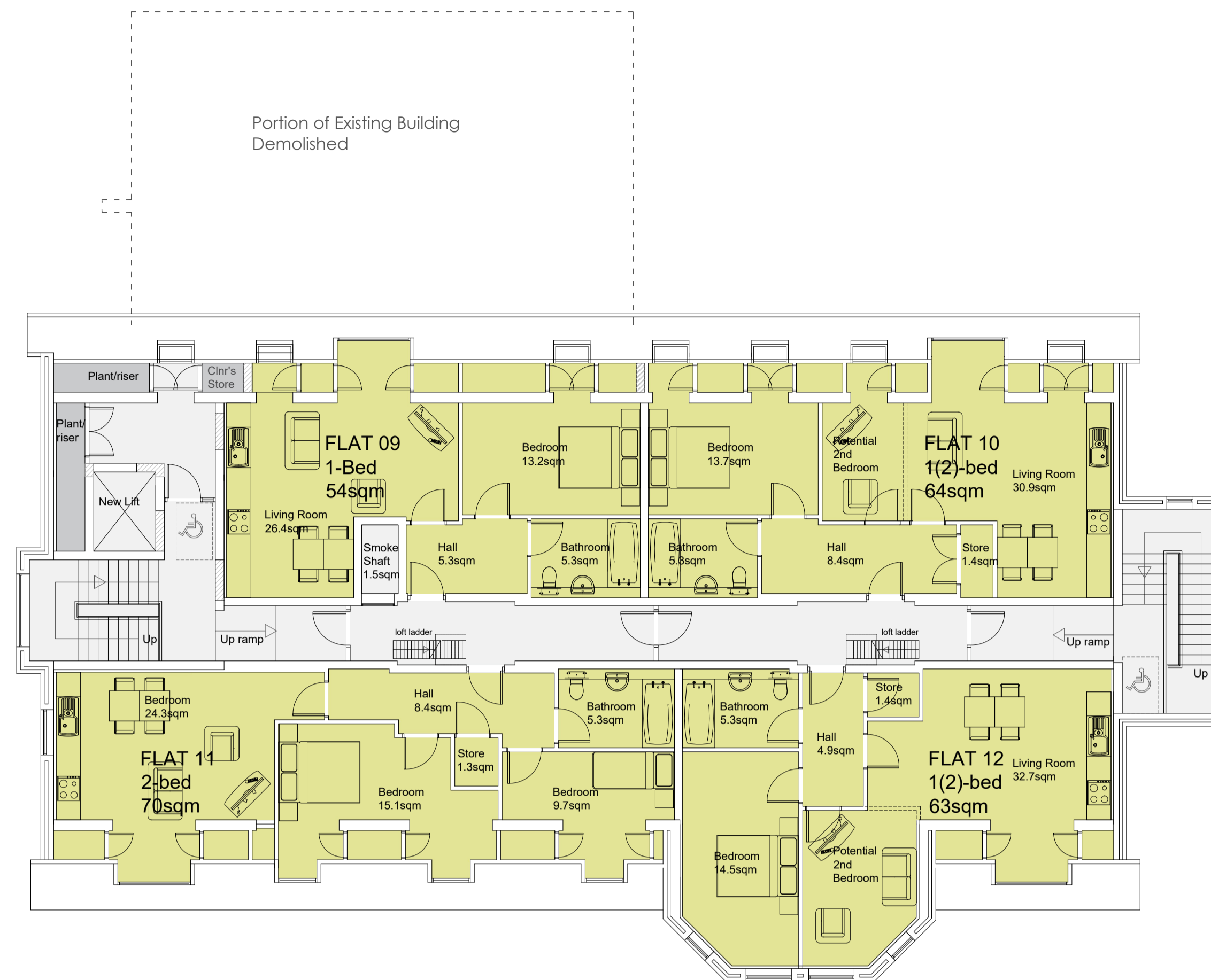
SECOND FLOOR PLAN AS PROPOSED