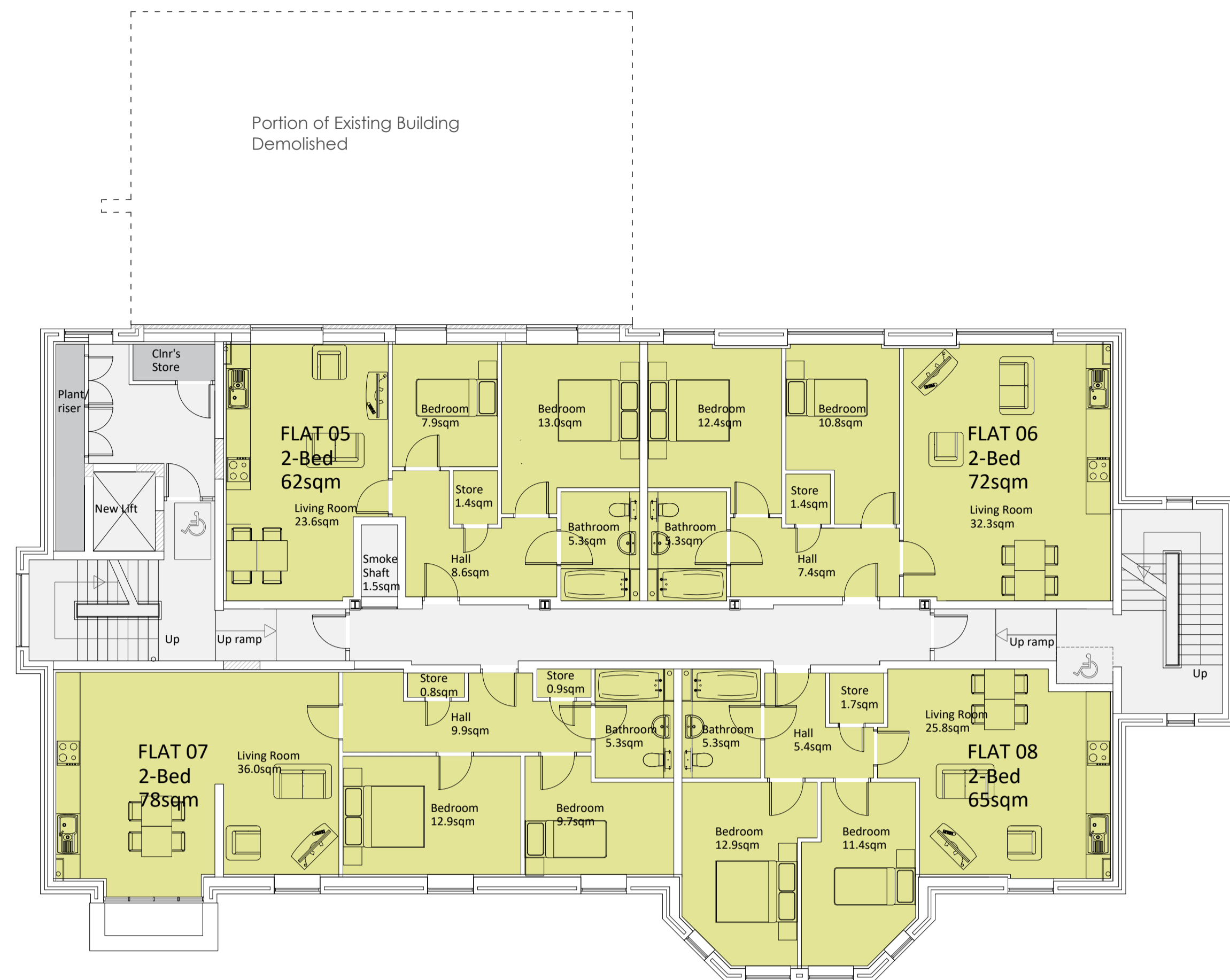
FIRST FLOOR PLAN - AS PROPOSED