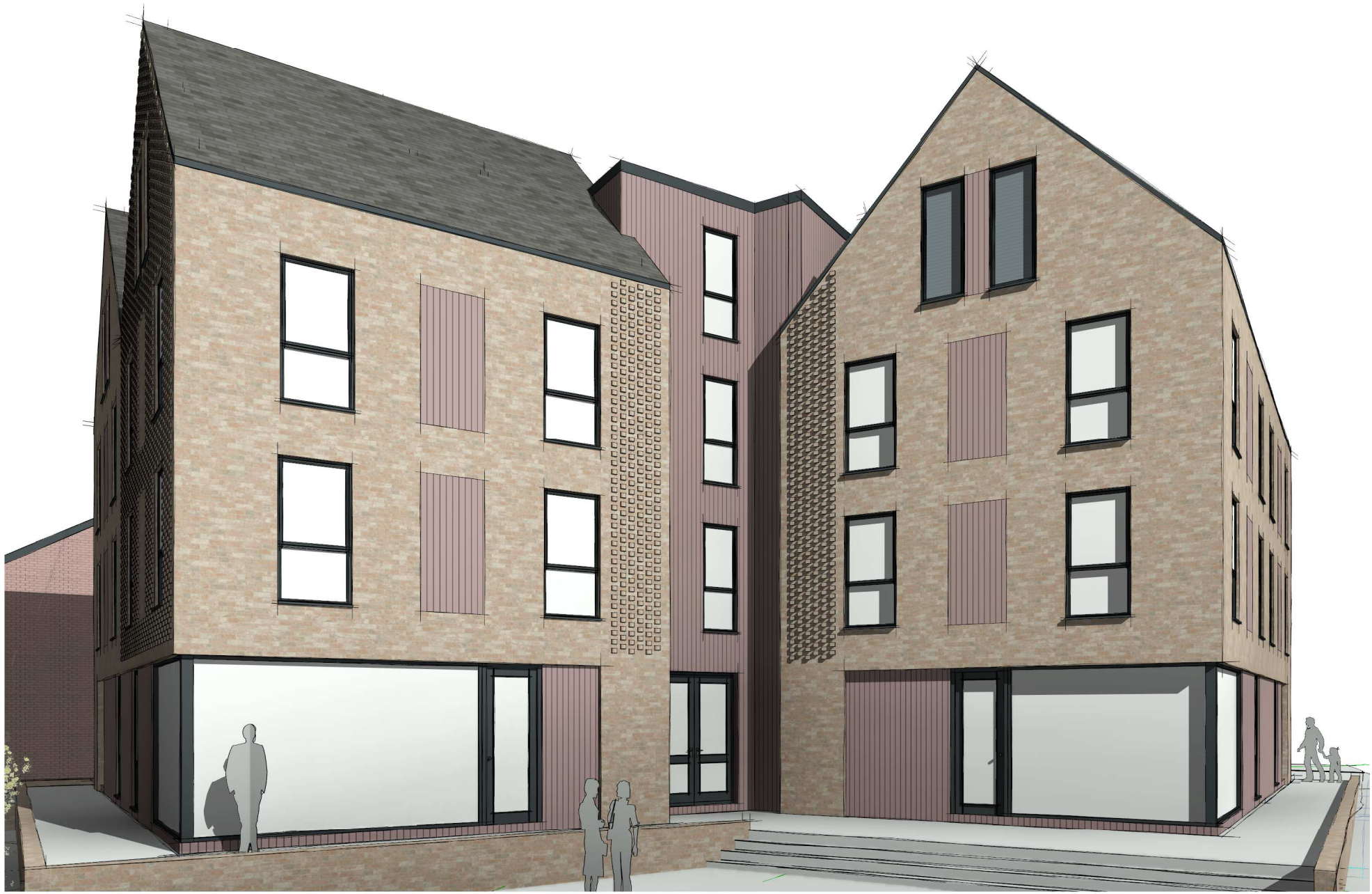
2 View of Main Entrance