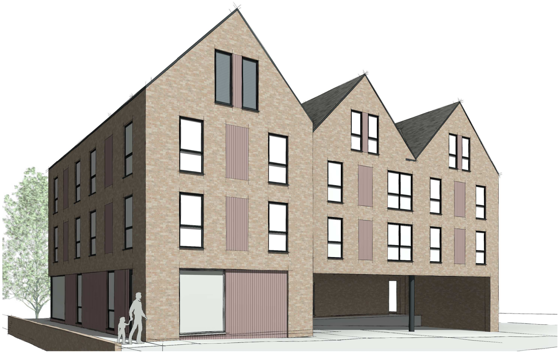
3 Rear View