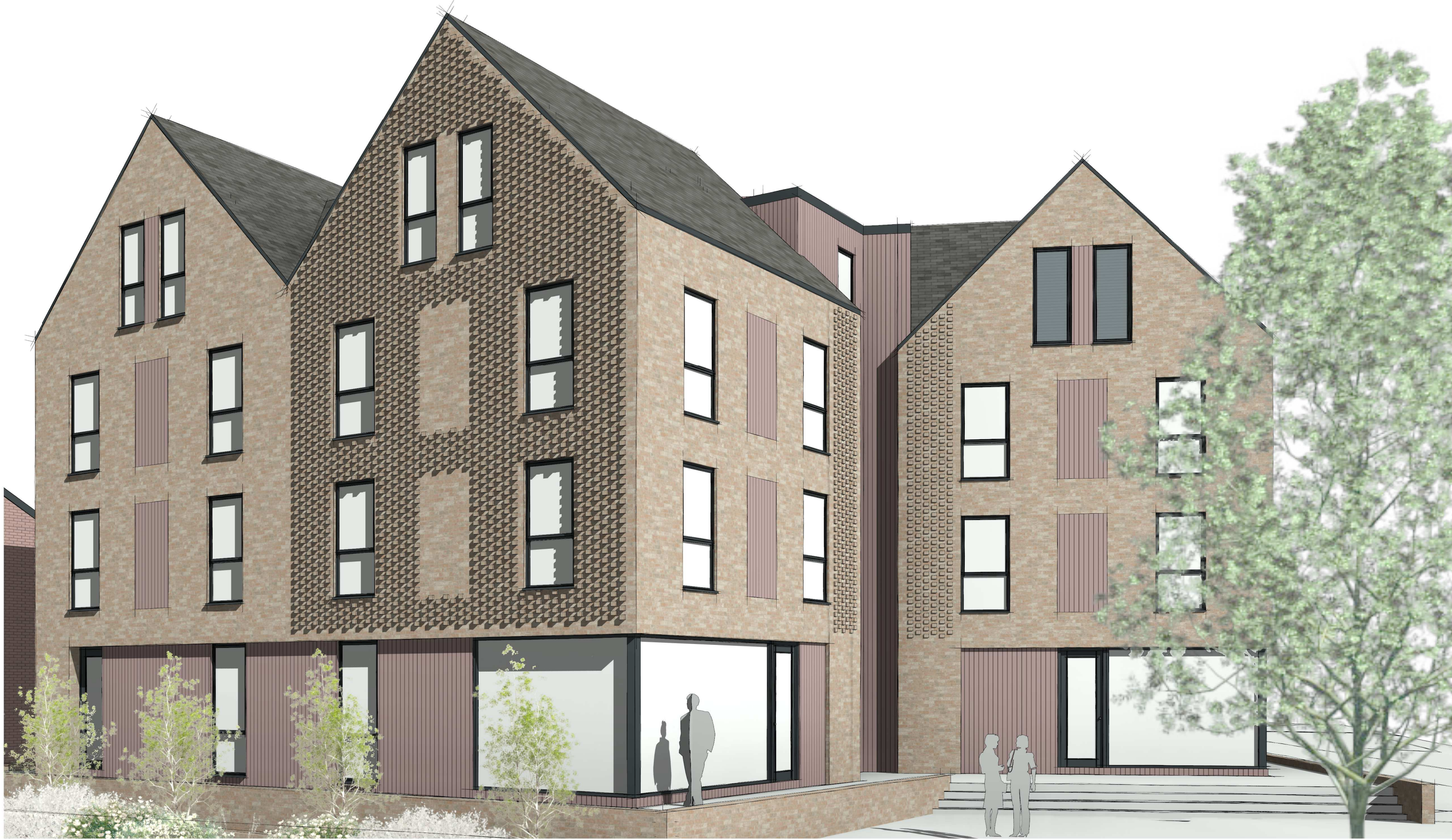
1 Front View